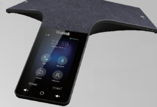
Yealink CP965 Conference Phone