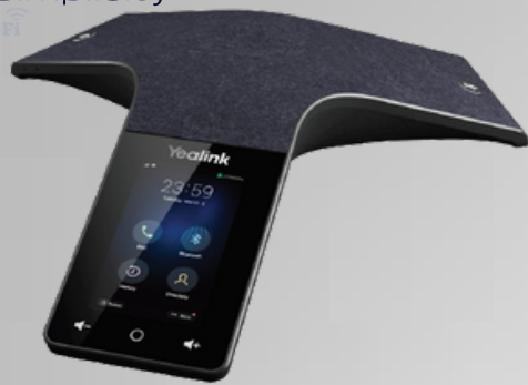
Yealink CP925 Conference Phone