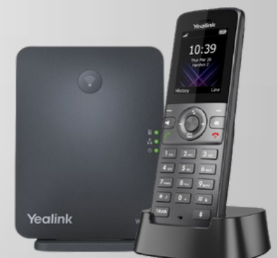
Yealink W73P Bundle W70B Base with W73H Handset