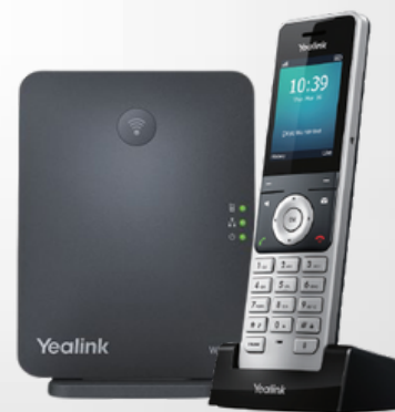
Yealink W76P Bundle W70B Base with W56H Handset