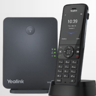
Yealink W78P Bundle W70B Base with W78H Handset