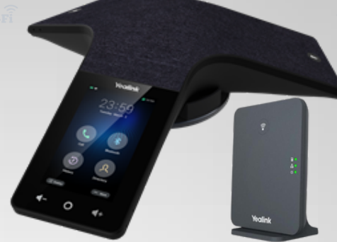
Yealink CP935W-Base Conference Phone with W70B Base