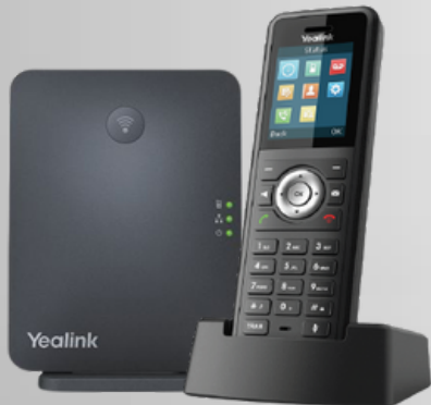
Yealink W79P Bundle W70B Base with W59R Handset