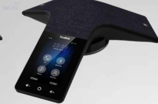
Yealink CP935W Conference Phone